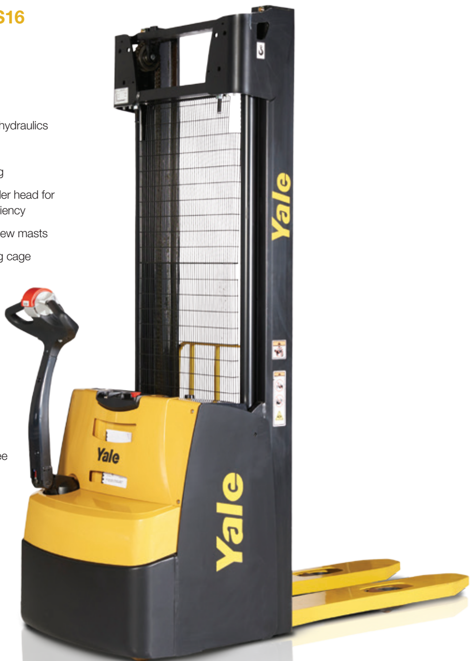
MS10 / MS16