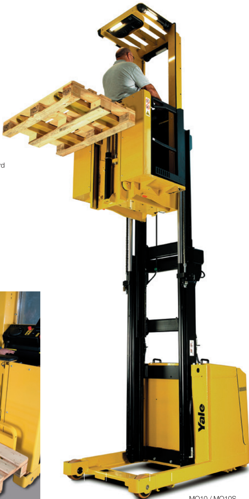
MO10 / MO10S